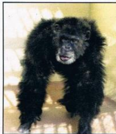
Clint Chimpanzee — died 2004 Yerkes Primate Center, Emory University, Atlanta

It's too late to help Clint—he died inside Yerkes but it's not too late to help other members of his family. Call and write today. They are waiting on you.